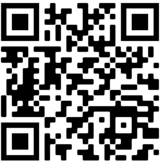
Scan this code to request prayer or to connect to the Grace community.